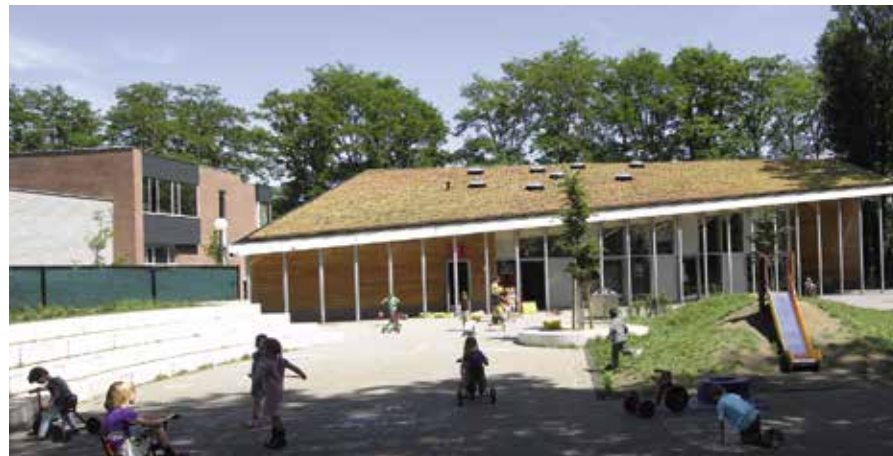
[111] KA Etterbeek Nursery School Working closely with the school's environmental coordinator, the architect incorporated environmental education into the project.