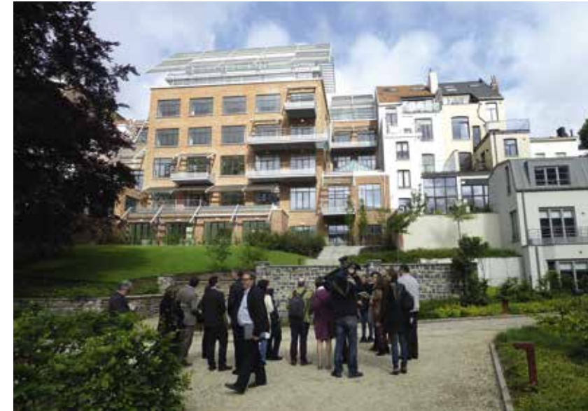
[171] Today, delegations of Belgian and foreign construction professionals come to visit the Exemplary Buildings and meet their Brussels counterparts. Here, a New York delegation visits the Croix-Rouge project.

www.environnement.brussels/batimentsexemplaires