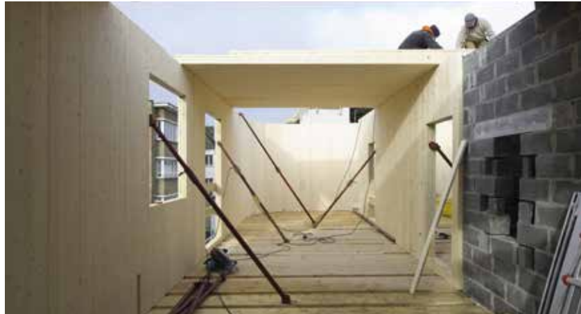
[238] Petite Senne A structure in entirely prefabricated, cross-laminated timber panels.