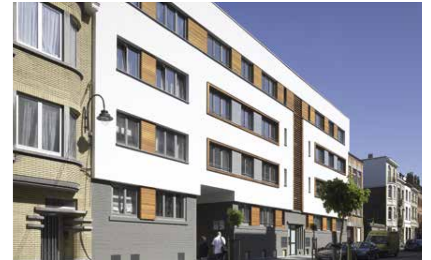
[095] Strauwen Renovation of an unoccupied 1930s building, comprised of 16 social apartments.

Here, there is no prototyping or high-tech approach, but instead a fine balance between the effort expended and the result obtained. In a word – efficiency.