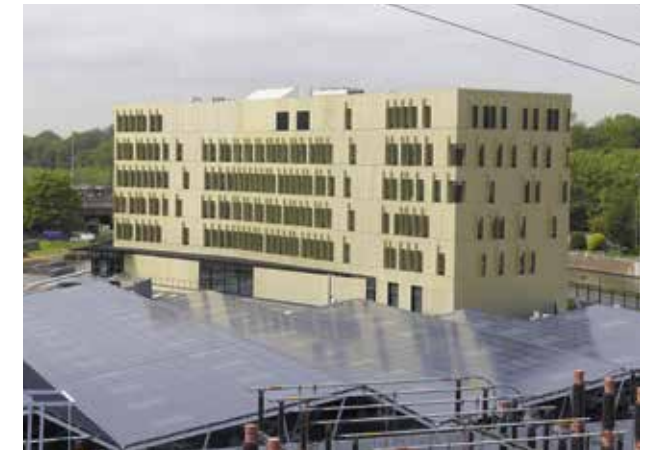
[040] [141] The feedback from Aeropolis II resulted in better solutions for the Quai Léon Monnoyer project.