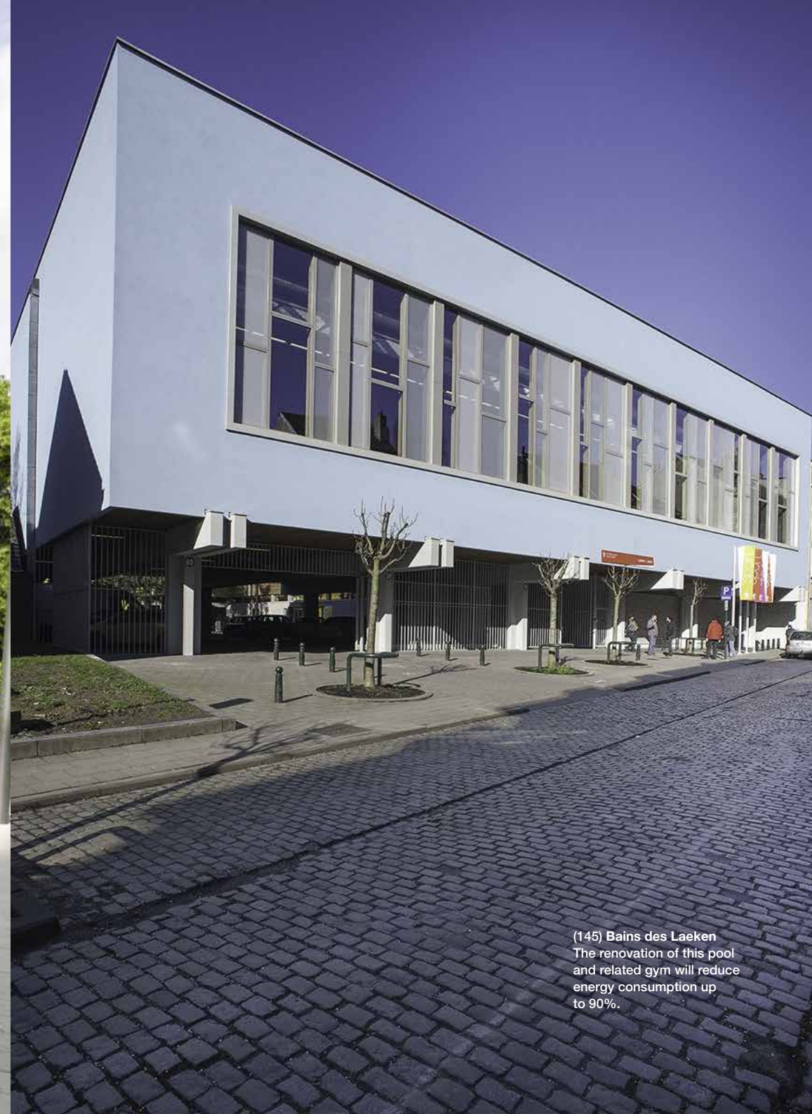
(145) Bains des Laeken The renovation of this pool and related gym will reduce energy consumption up to 90%.