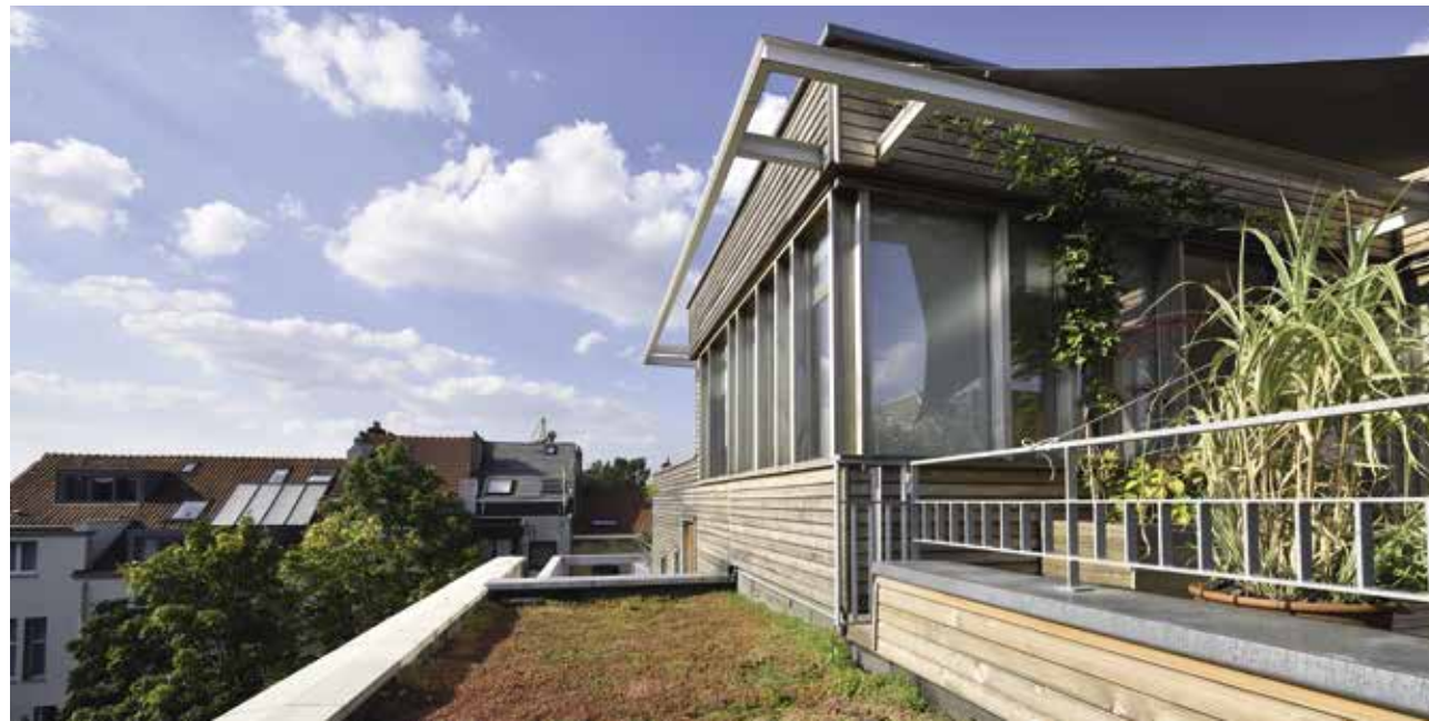
[127] Rue Léon Cuissez Planting in open ground, green roofs and living walls for an old garage.

Ecoconstruction, and everything that underpins it, is one of the 4 selection criteria. These parameters, which are often perceived as hard to quantify, are given special attention in the BatEx buildings. Indeed, the performance in itself is not the goal: the building must be pleasant to live in, an aim which the BatEx projects tackle fervently.