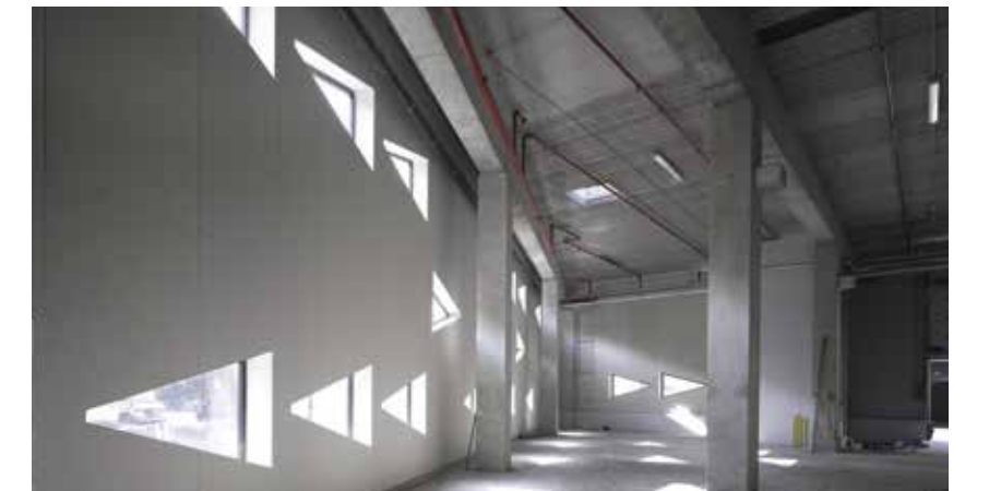
[226] Greenbizz A passive Exemplary Building, along the canal, which accommodates a business incubator for sustainable projects.