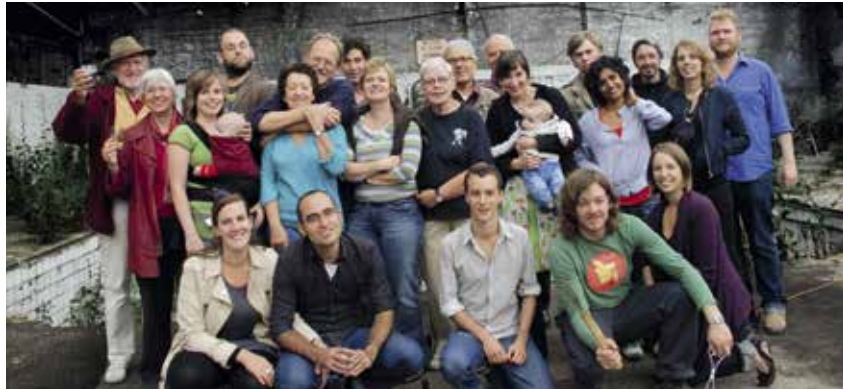
[097] Brutopia Participative housing with 27 homes and businesses.