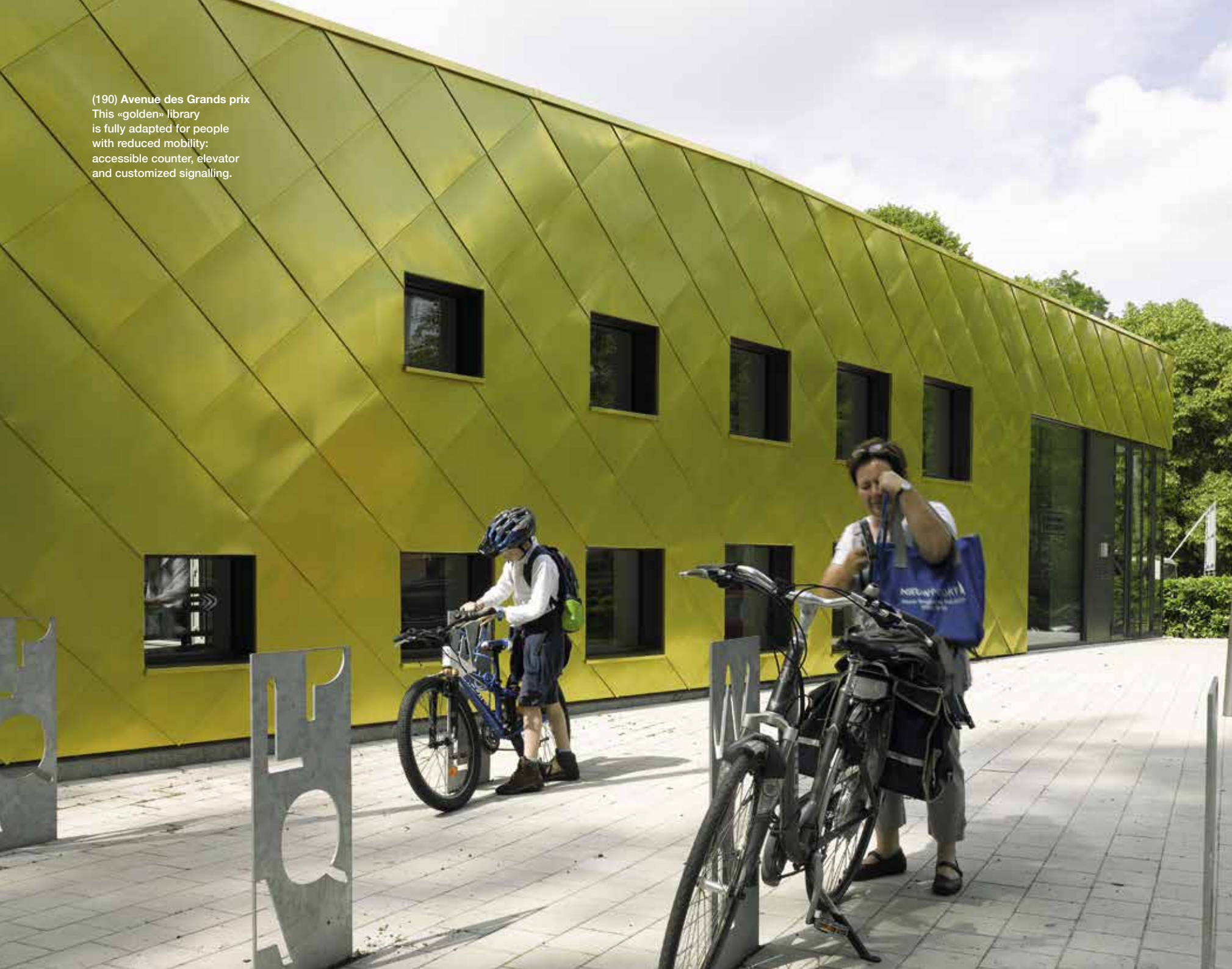
(190) Avenue des Grands prix This «golden» library is fully adapted for people with reduced mobility: accessible counter, elevator and customized signalling.