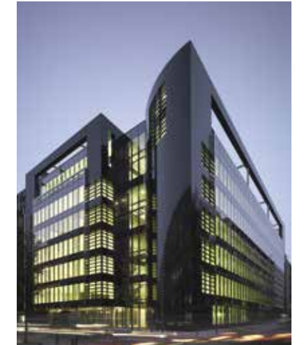
[177] Black Pearl 11,500m 2 of BREEAM certified offices.