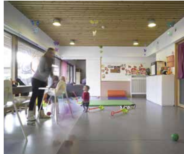
[025] Caméléon This 13,000m 2 commercial project also included a neighbourhood crèche for 39 children.

More than a quarter of the winning projects are intended to improve the daily lives of Brussels citizens. In particular, by improving the reception environment in the health care sector, such as the Brugmann Trauma Centre or the 4 winning nursing homes resulting from these 6 calls for tenders. Or by working together, like the SIAMU forward emergency post, the Brugmann hospital on the Brien site and the La Cerisaie nursing home, whose heat production is communal. (Young) childhood is not forgotten either, thanks to the 21 schools and 23 nurseries (private and public) which have appeared since 2007 as part of the BatEx programme.