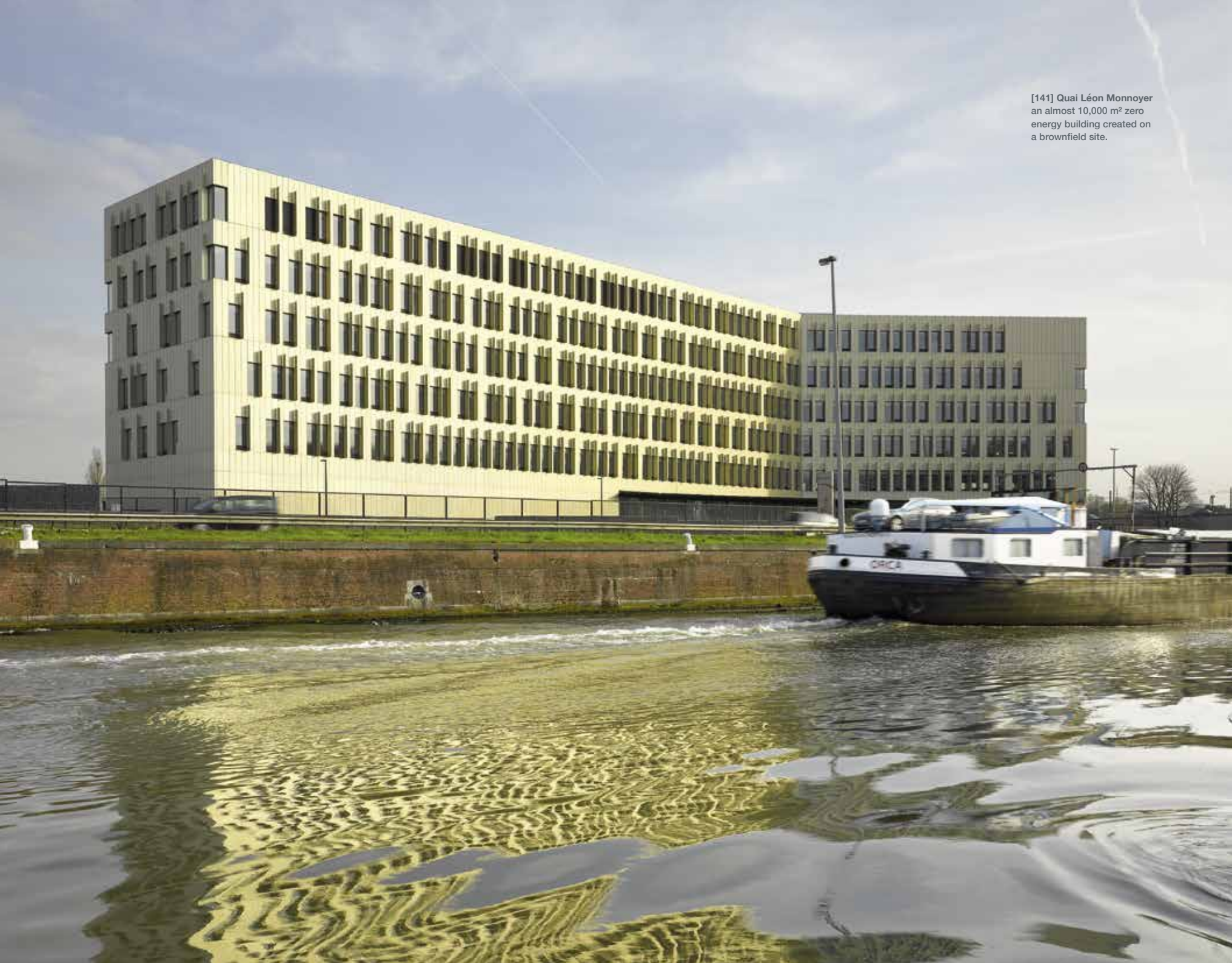
[141] Quai Léon Monnoyer an almost 10,000 m 2 zero energy building created on a brownfield site.

You are holding a calling card of the Brussels-Capital Region, as it were, enriched with images of the report on the six “Exemplary Building” calls for projects and illustrating the sustainable buildings created within this framework since 2007.