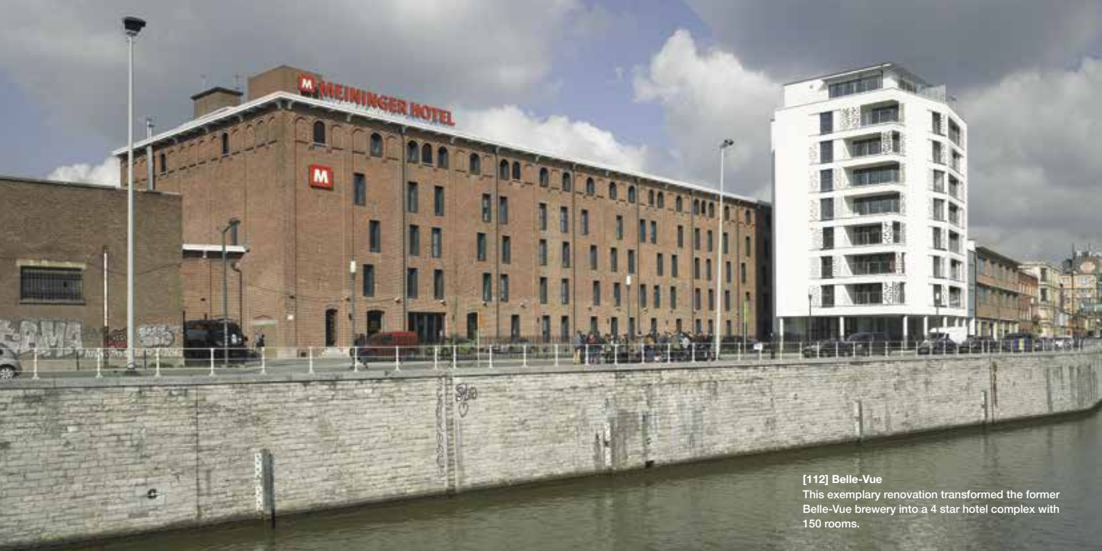
[112] Belle-Vue This exemplary renovation transformed the former Belle-Vue brewery into a 4 star hotel complex with 150 rooms.